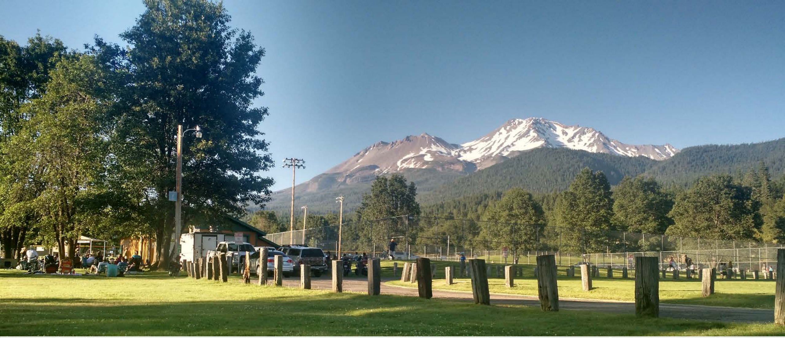
Mt. Shasta, California