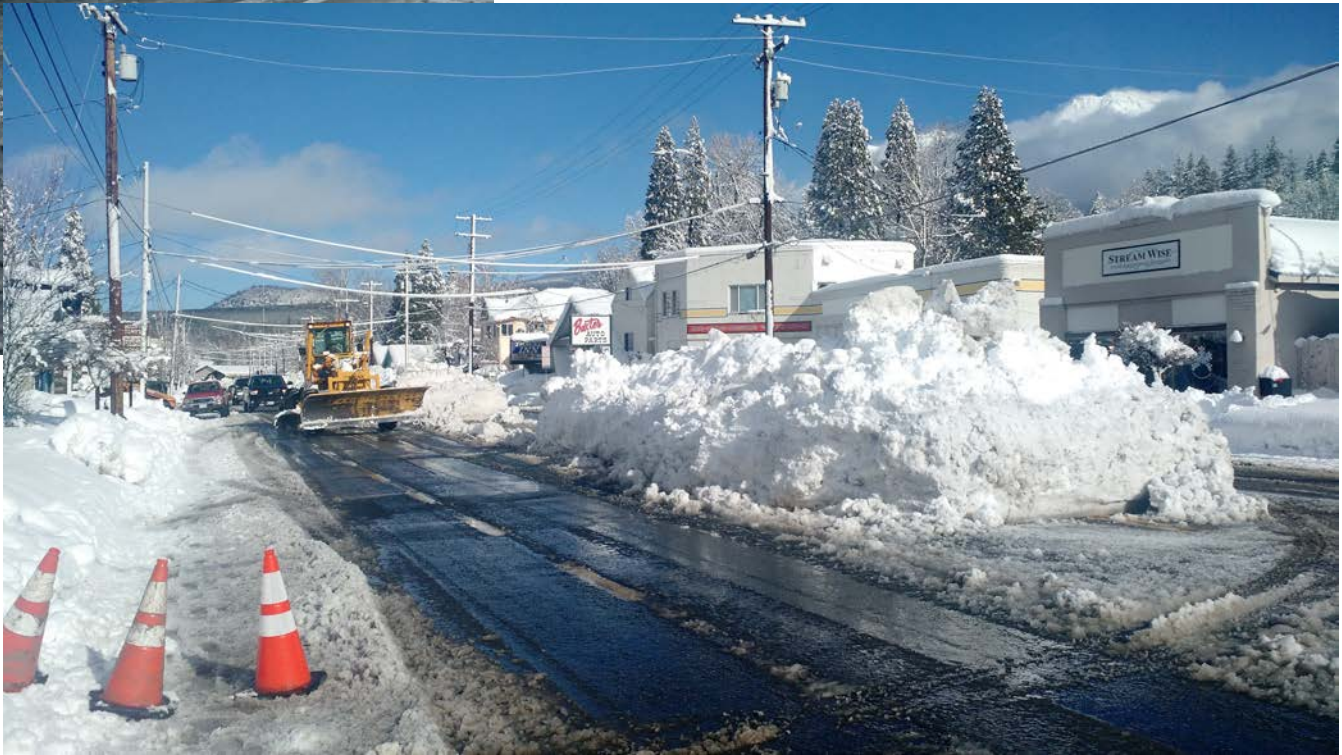
Mt. Shasta experiences heavy snow in winter months which influence road design.